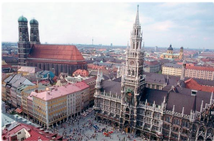
Munich city view