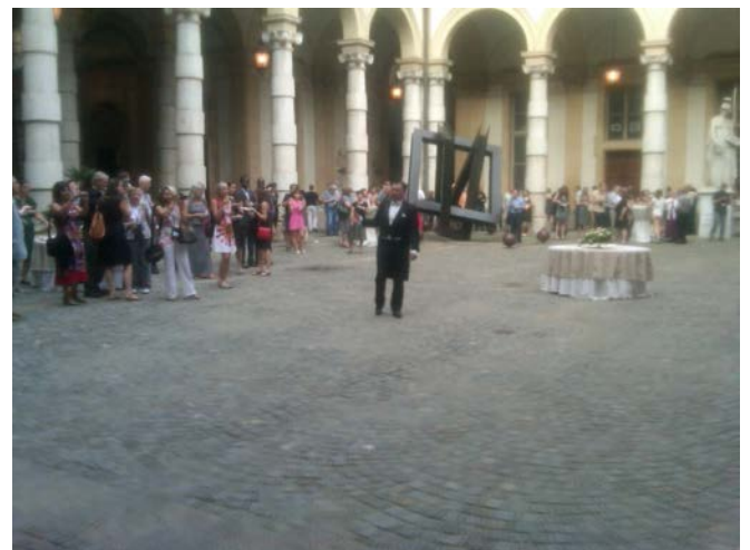
Italian tenor entertains at 2014 KBS reception