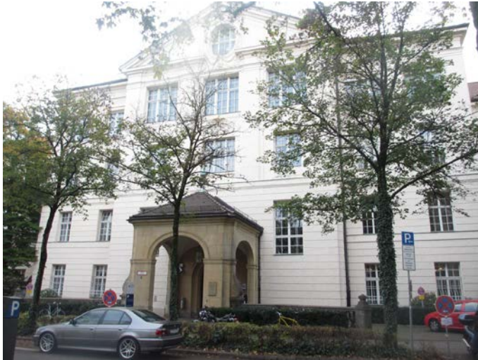
Department of Psychiatry

The 2015 KBS Symposium will be held at the Ludwig-Maximilians-University, Department of Psychiatry and Psychotherapy, Nussbaumstraße 7, Munich, Germany (see map on page 8).