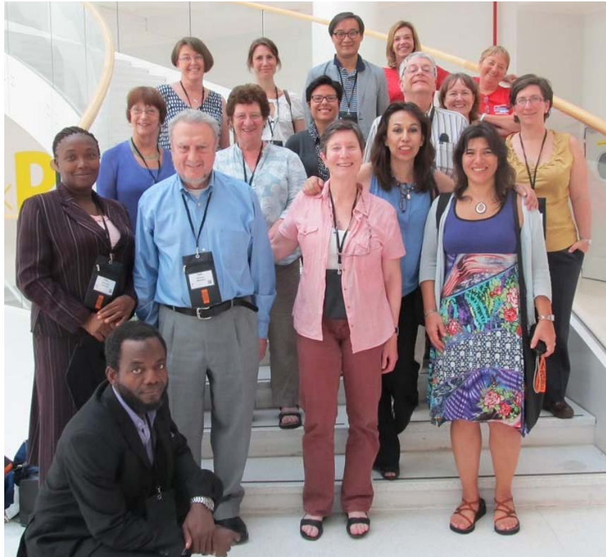
2014 GENACIS and Harms to Others Workshop, Torino, Italy

The 2014 GENACIS/ IGSAHO (International Group for the Study of Alcohol's Harm to Others) workshop was held in conjunction with the 40 th Annual Symposium of the Kettil Bruun Society in Torino, Italy. The 2015 KBS Symposium will be held in Munich, Germany, June 1-5, 2015. The joint GENACIS-IGSAHO workshop will be on Tuesday, June 2.