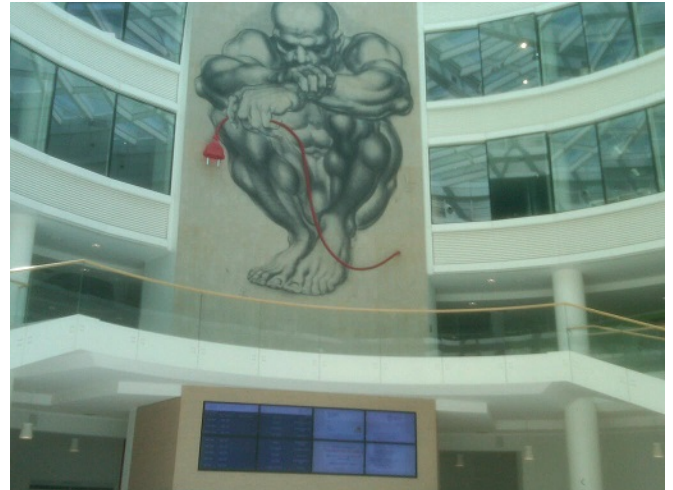
2014 KBS conference site in Torino, Italy