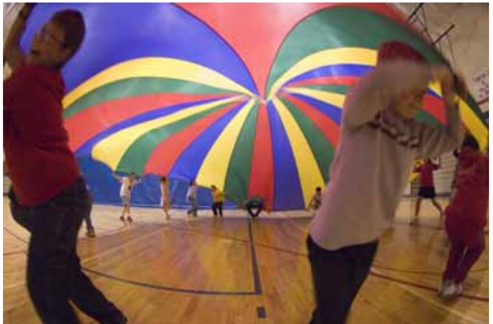
Kids at Burlington-Des Lacs Elementary play with a parachute during physical education class, one of the many ways the CATCH program makes fitness fun.

Go, Slow and Whoa. With these simple labels on the foods they serve, CATCH schools are teaching even the youngest children about the foods they eat. Go foods are lowest in fat and should be eaten more often than the higher-fat Slow and Whoa foods.