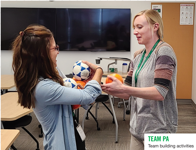
TEAM PA Team building activities for the Class of 2024 during their first week in the program