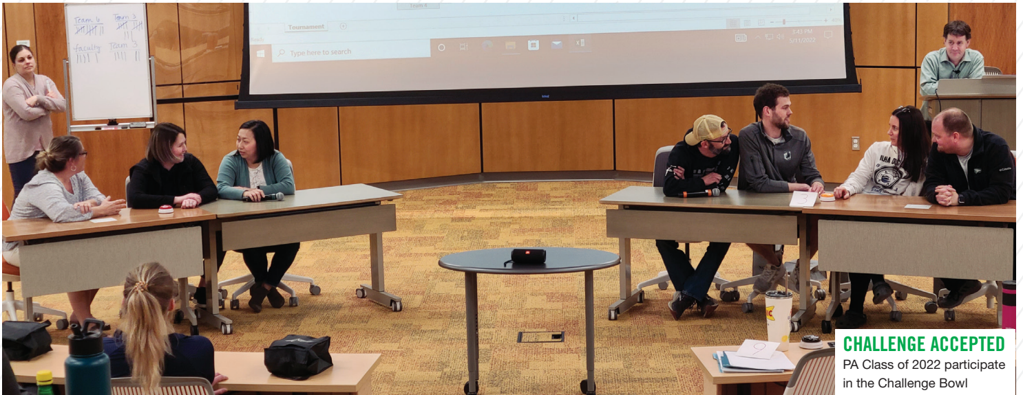
CHALLENGE ACCEPTED PA Class of 2022 participate in the Challenge Bowl