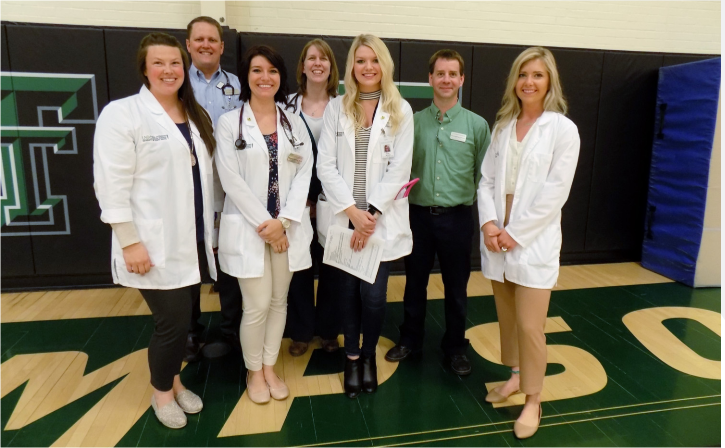
Students and faculty volunteering for athletic physicals at a local rural high school