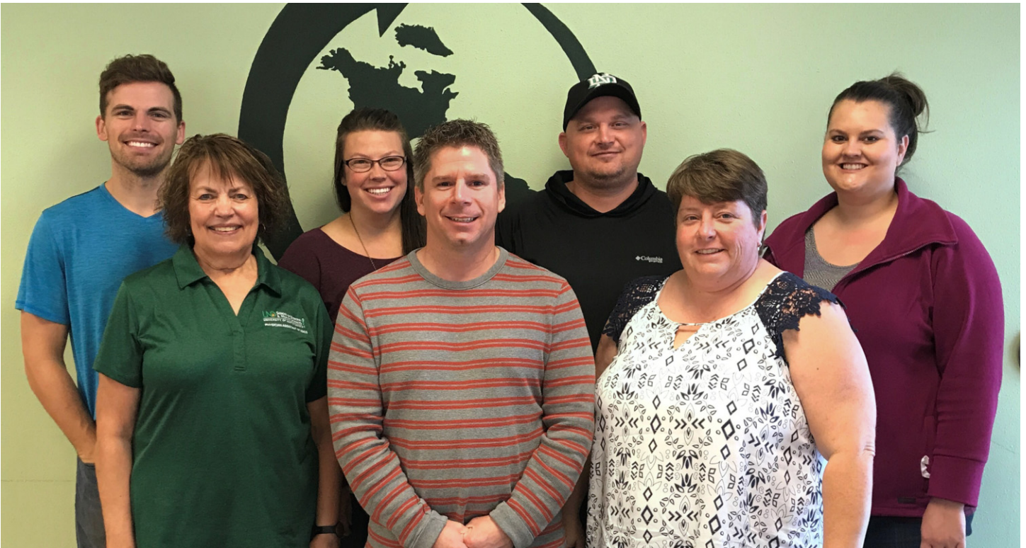
Students and faculty volunteering at HERO (Healthcare Equipment Recycling Organization) in Fargo