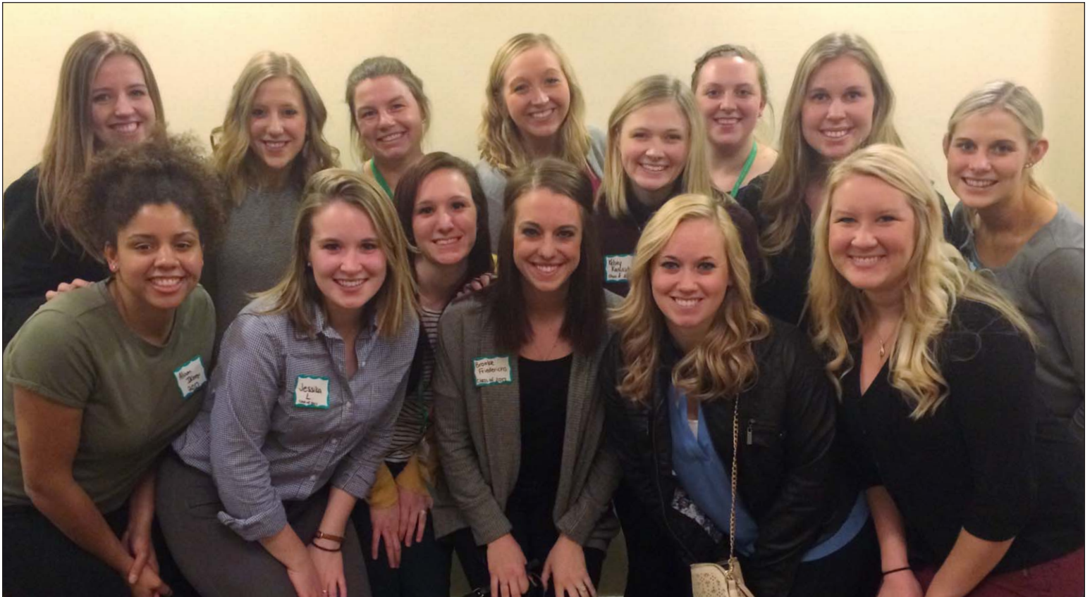
UND OT students represented North Dakota well at the AOTA Annual Conference and Expo in Chicago in April.