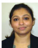
Vinita Vaidya Government Medical College Nagpur